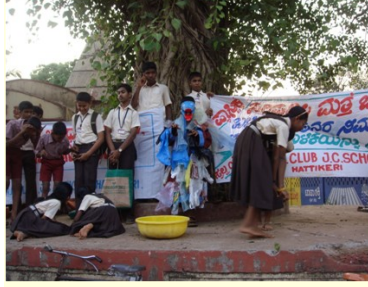
Students enacting a play during Anti-plastic campaign

Anti plastic campaign in Ankola town was initiated by the DNA Club Members of Jaycee English Medium High School and the Town Municipality, Ankola. Survey of daily plastic carry bag con-