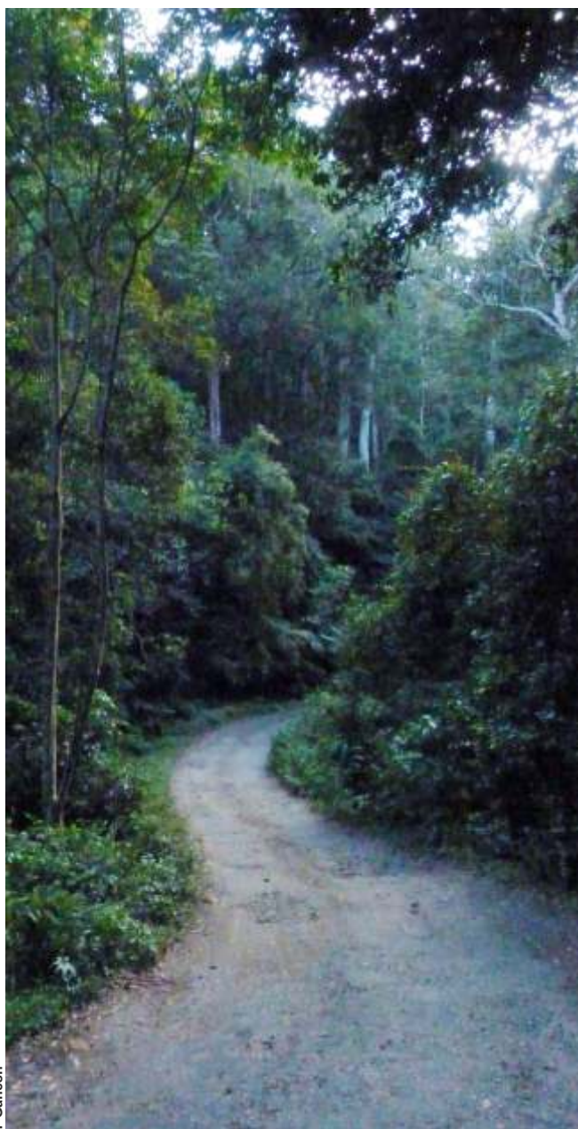
Wet evergreen forest of KMTR