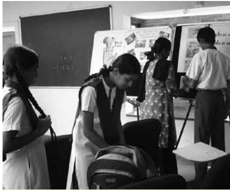
In preparation- Bengaluru schools put up display material

Salwan Public School did a project called 'Parivartan'. The students got a tailor to stitch cloth bags from old clothes and gifted these bags to the residents of their area to use as an alternative to plastic bags. This simple project generated awareness and positive response from residents of that area. Father Agnel School's project was on waste management. They created utility products: folders, floor cleanser from the waste generated in their school to make it a zero-waste school.