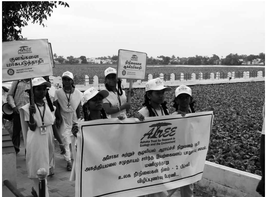
Students leading a procession.

River Tamiraparani and its associated rivers and tanks are a source of drinking water and irrigation for Tuticorin and Tirunelveli districts of